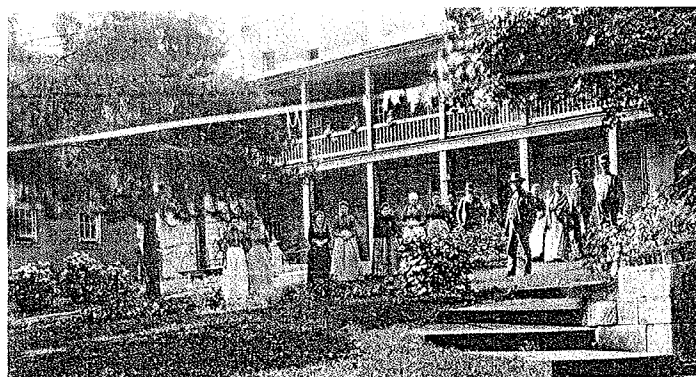
Columbiana County Infirmary