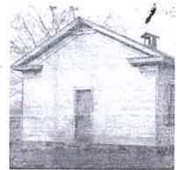
Mt Nebo Grange Hall